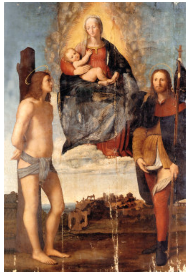
Madonna, Jesus & Saints 0703