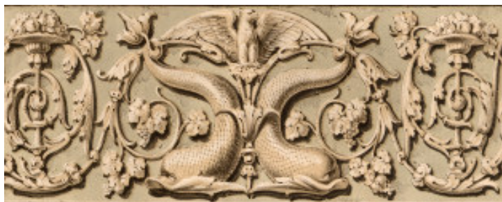
Cherub Frieze 2 Private Collection