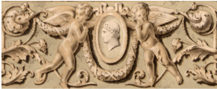
Cherub Frieze 1 Private Collection