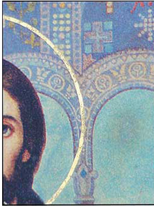
Close up of Gold-Leafed Halo