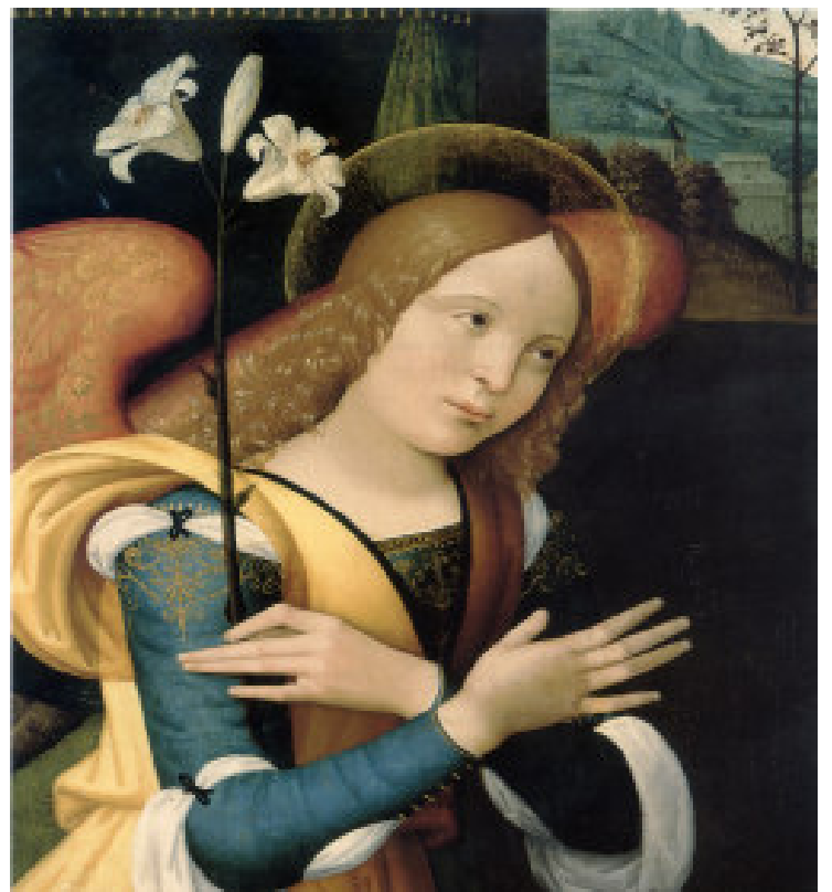
Annunciation 07 - 16 x 18 Wall Hanging