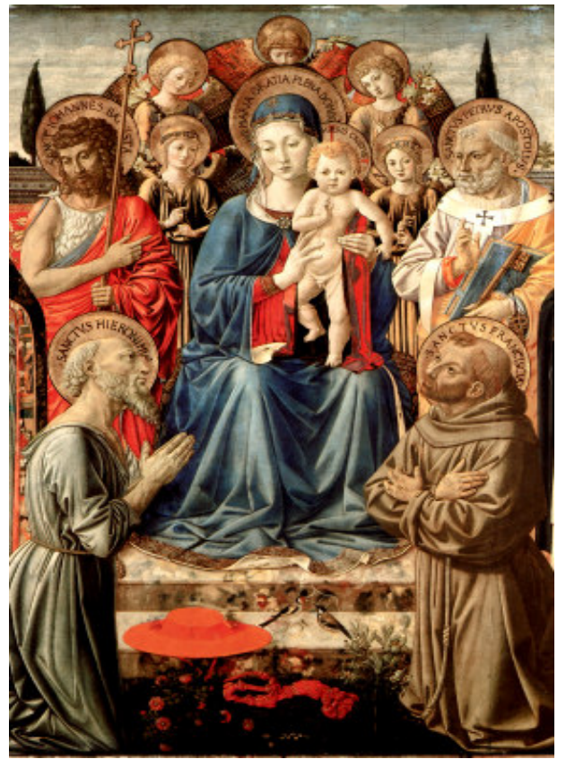
Christ 10 0104