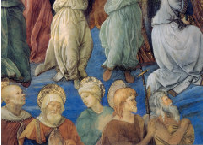
Coronation of The Virgin - 2 tiles or two wood tablets