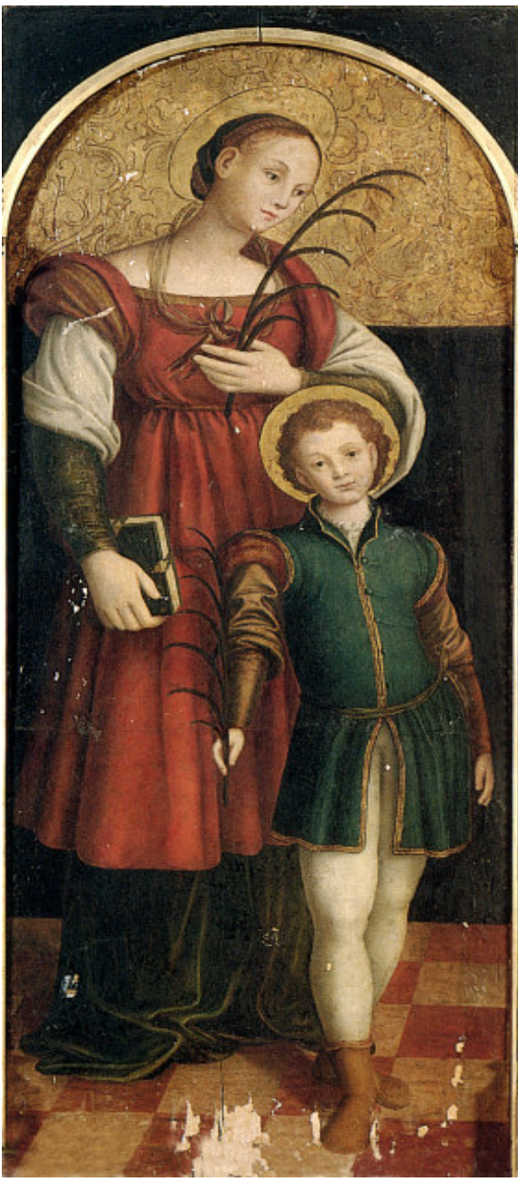
Christ 11 0104