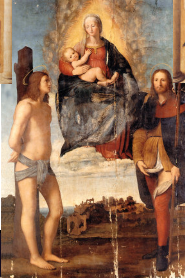
Madonna & Saints