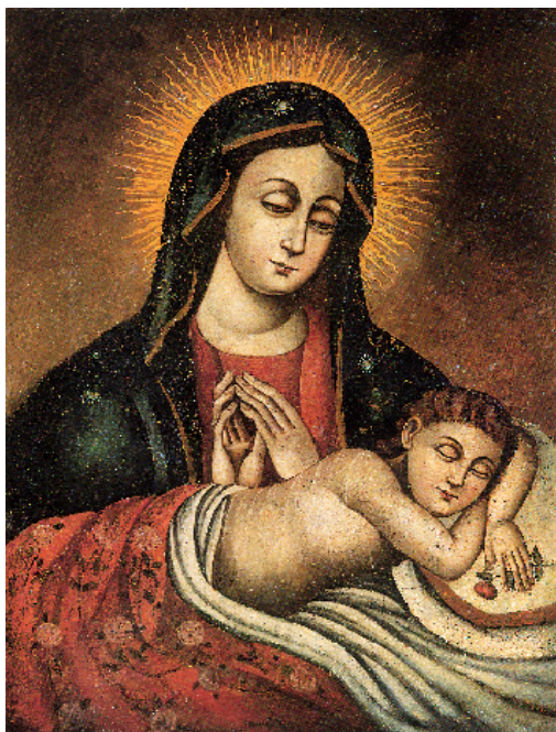
The Armenian Madonna