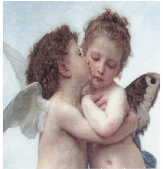
The First Kiss