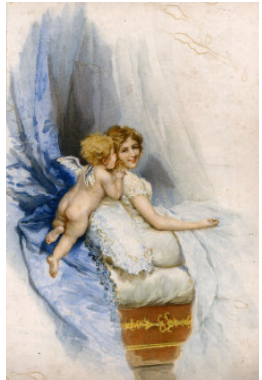
The Cherubs Whisper - Private Collection