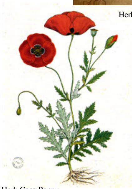
Herb Corn Poppy