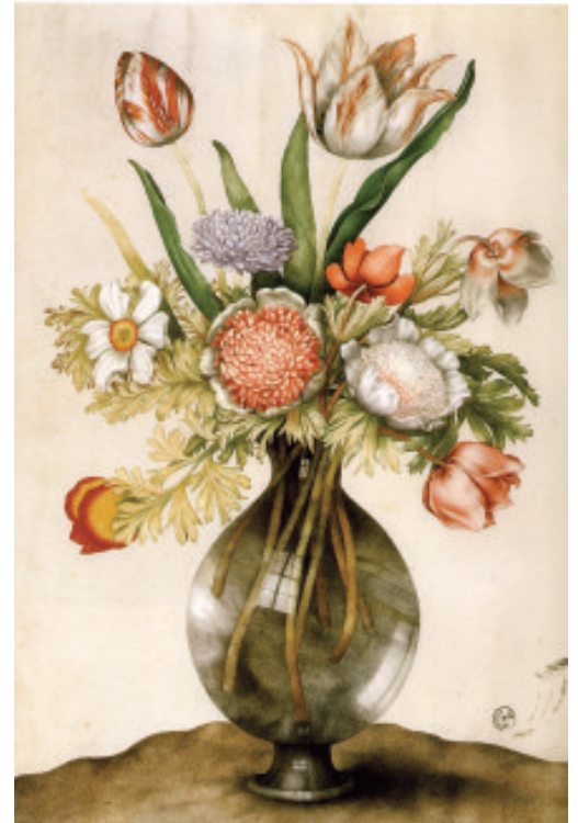
Garz Vase 1 057-1