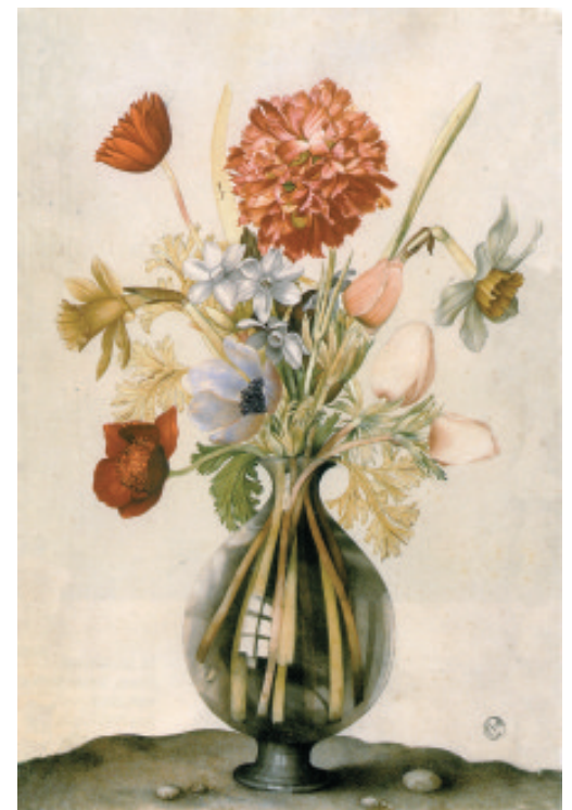
Garz Vase 2 057-2