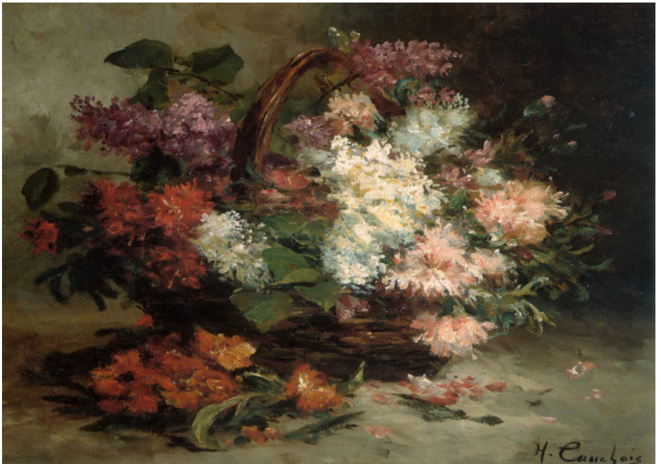
Flowers Cauchois 1 0601-18 - France c. 1900