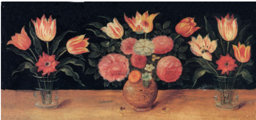
Tulips in Vases 1