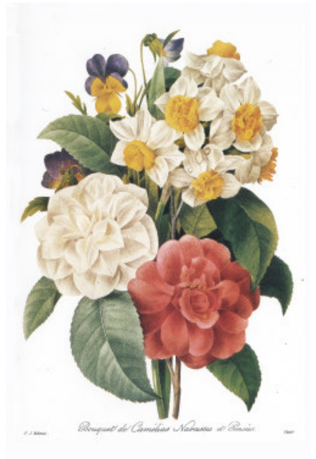
Bouquet Camelia 04724