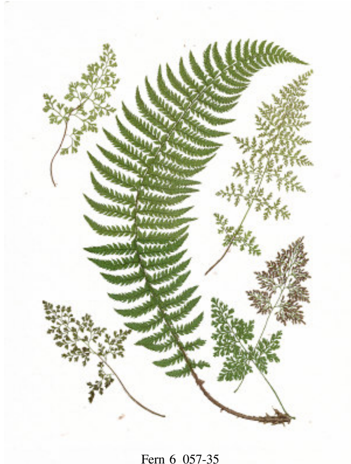
Fern 6 057-35