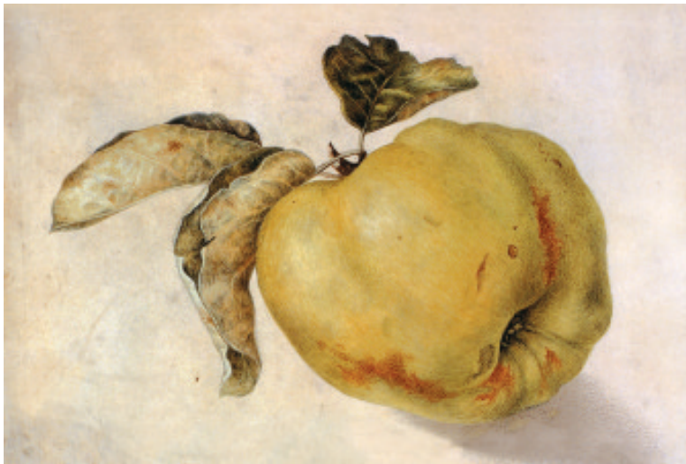
Garz Quince 057-3