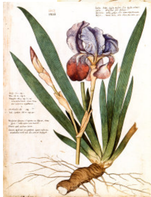
CLU Iris 2