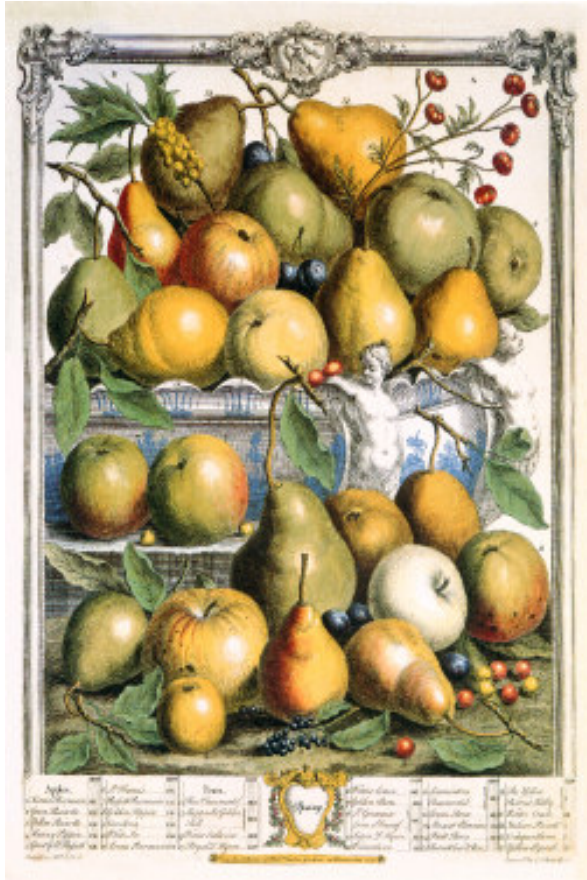
Fruit Spring 0601-3