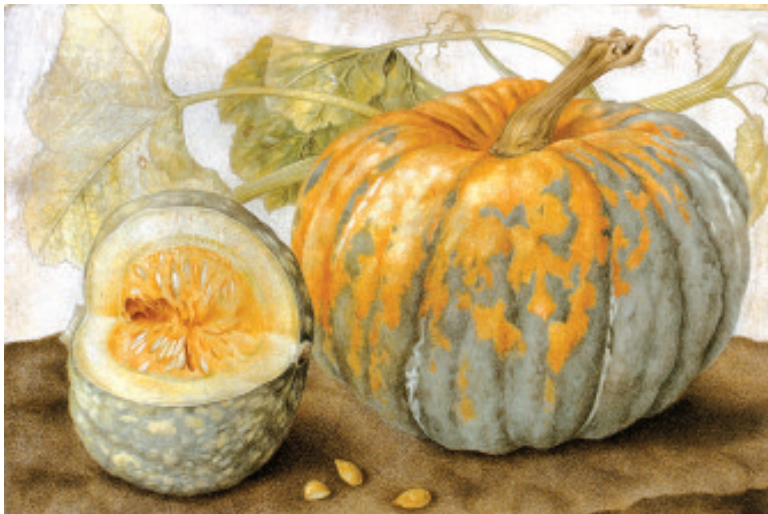
Garz Squash 057-5