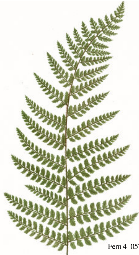
Fern 4 057-33