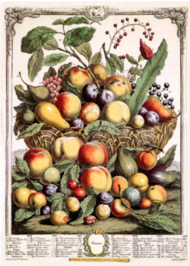
Fruit Summer 0601-4