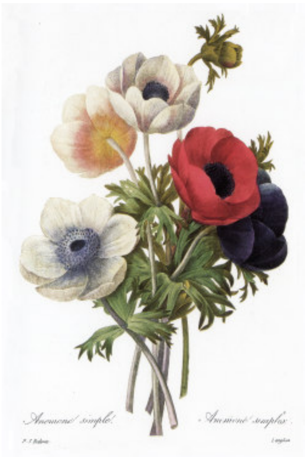
Bouquet Anemonie 04723