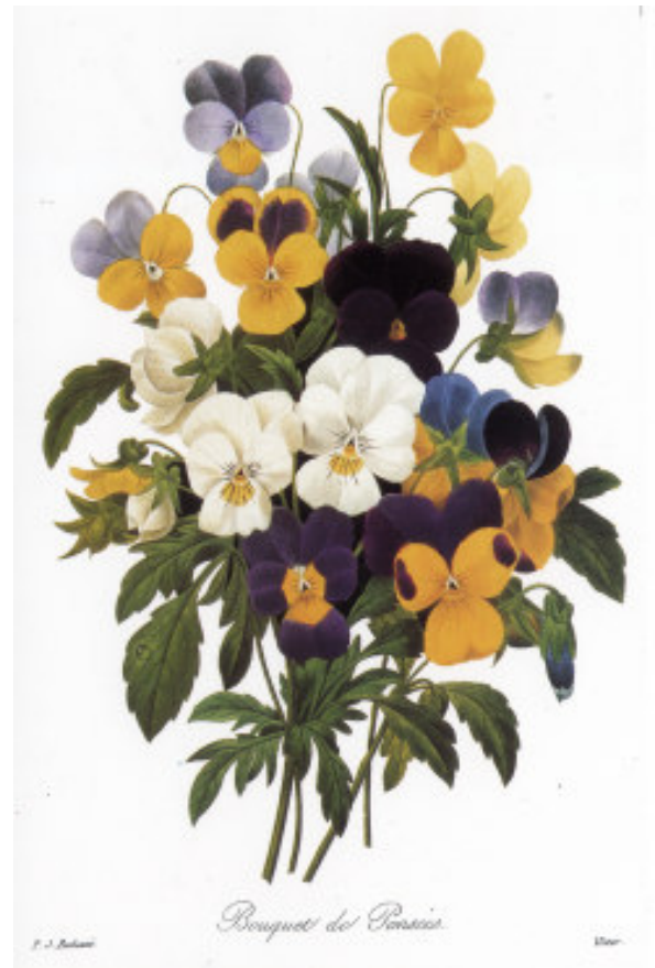
Bouquet Pansy 04726