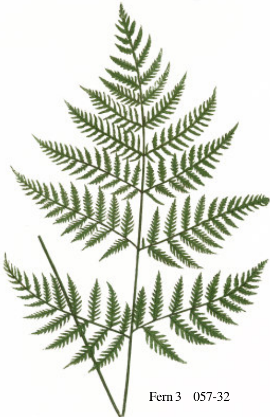
Fern 3 057-32