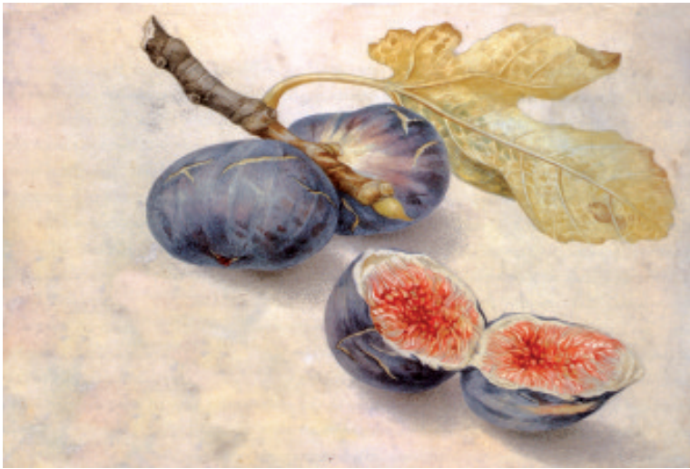
Garz Fig 057-4