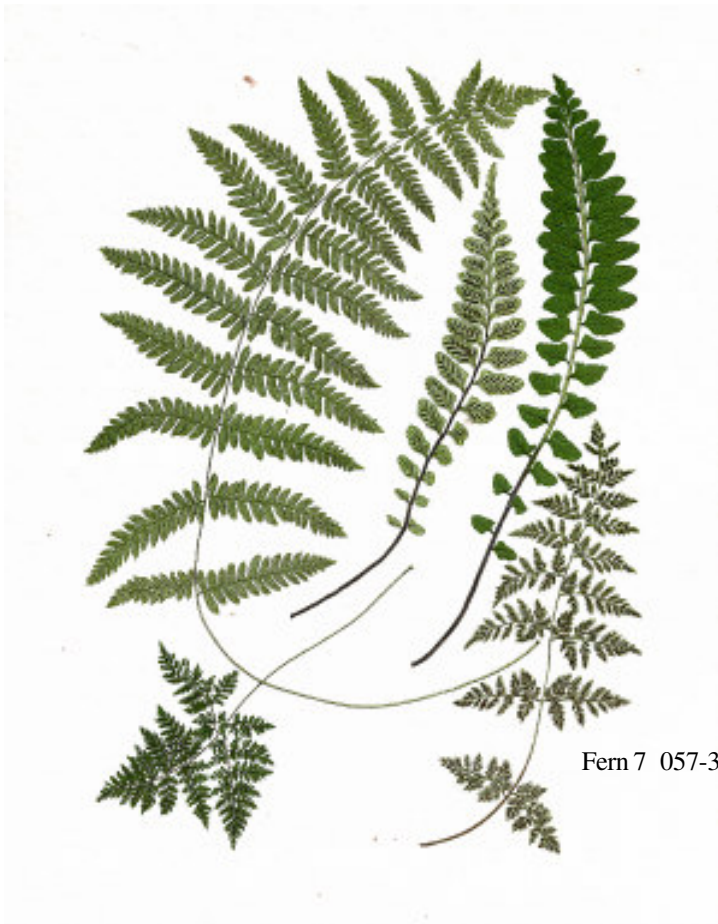
Fern 7 057-36