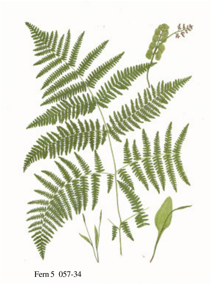
Fern 5 057-34