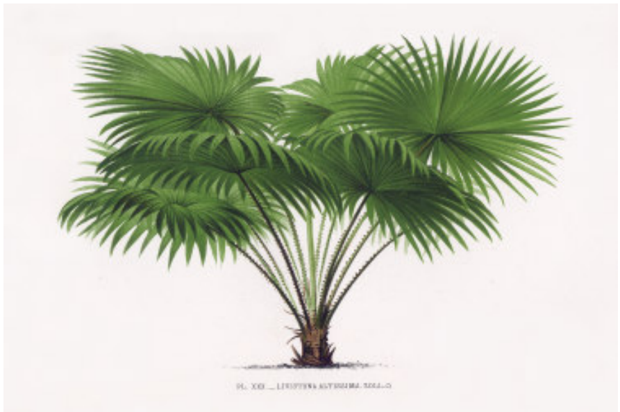
Palm 30 0601-12