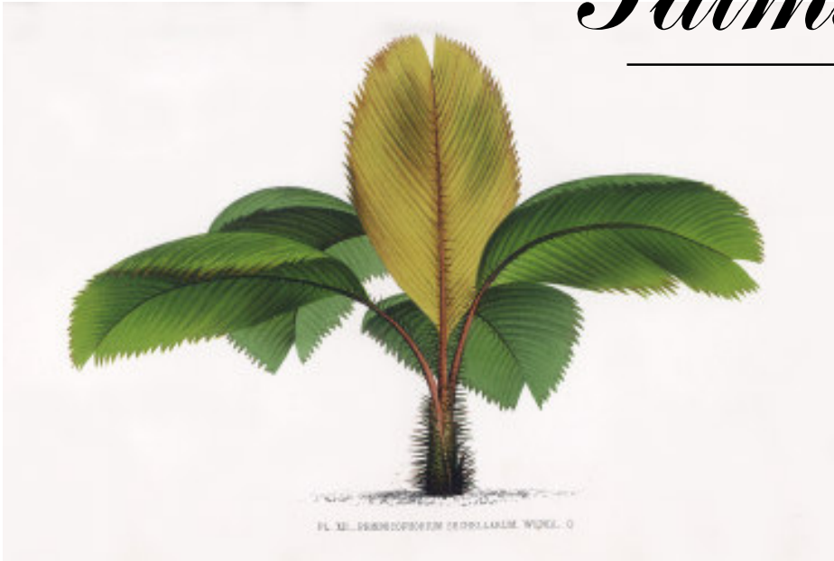
Palm 12 0601-11