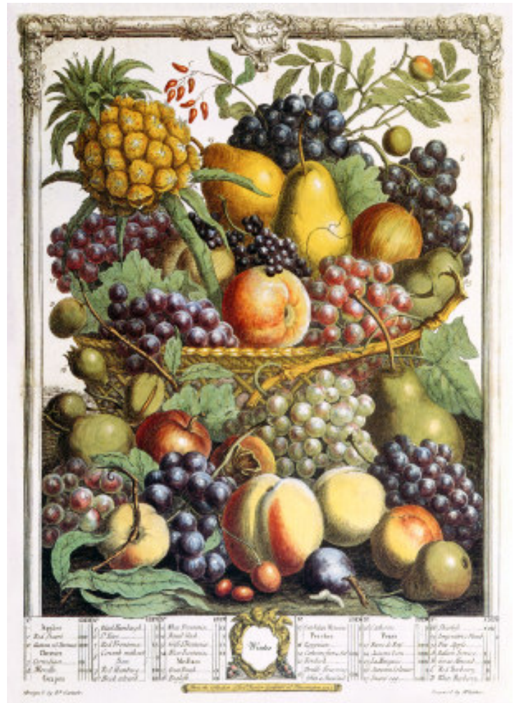
Fruit Winter 0601-6