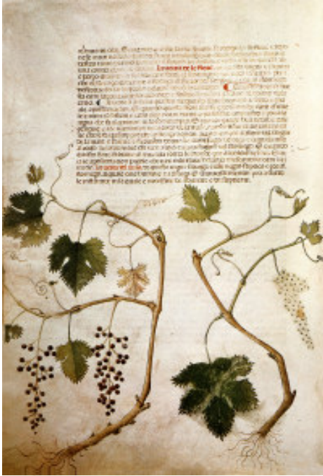
Herb Vine 1