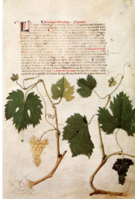
Herb Vine 2