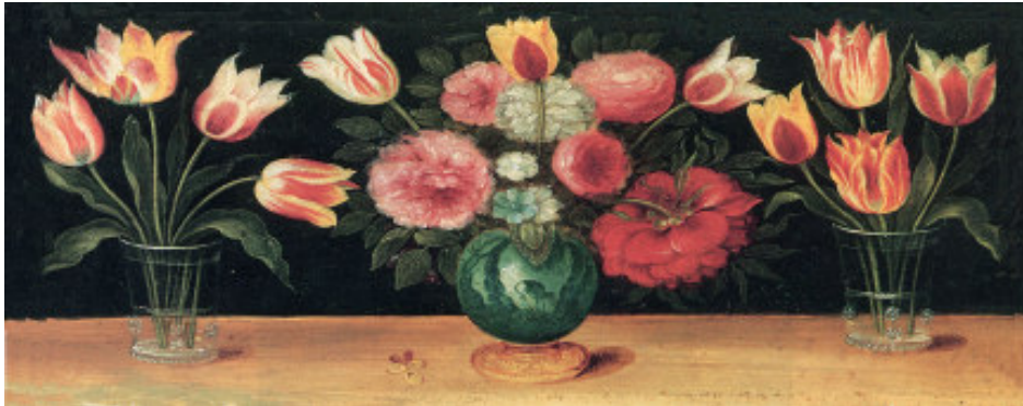
Tulips in Vases 2