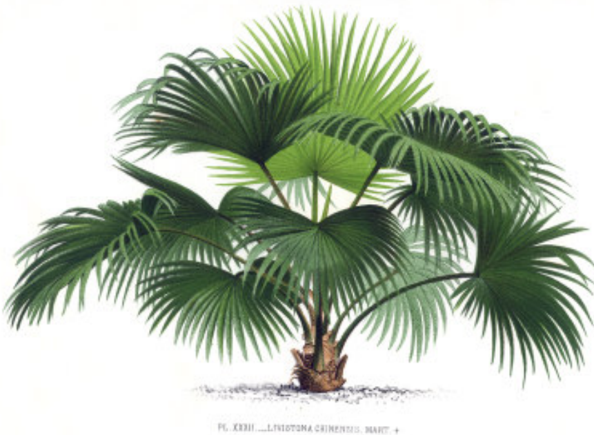
Palm 32 0601-13