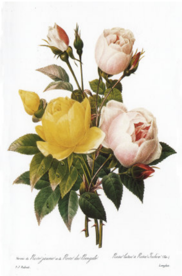
Bouquet Rose 04725