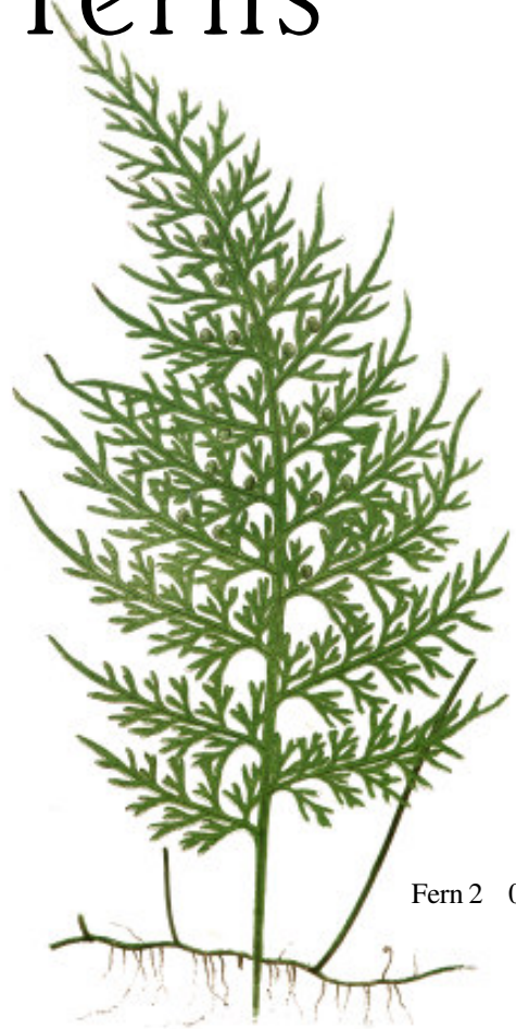
Fern 2 057-31