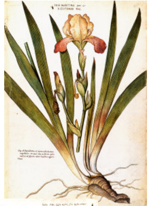
CLU Iris 1