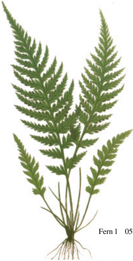
Fern 1 057-30