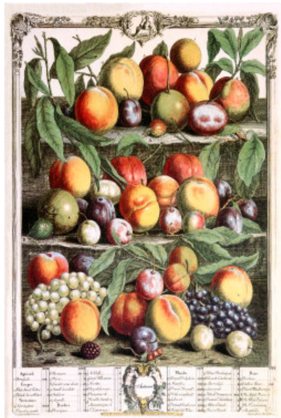
Fruit Autumn 0601-4