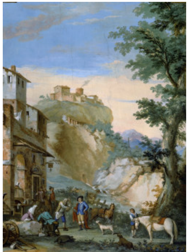
Villa Poggio 2