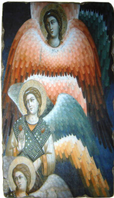
Judgement Angel 2

Exquisite and rare aged tiles 9" x 16" and 3/4 thick - each weighs 7lb.