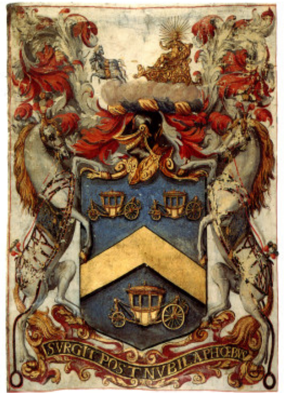
Coach Arms - England 16th century - exquisite