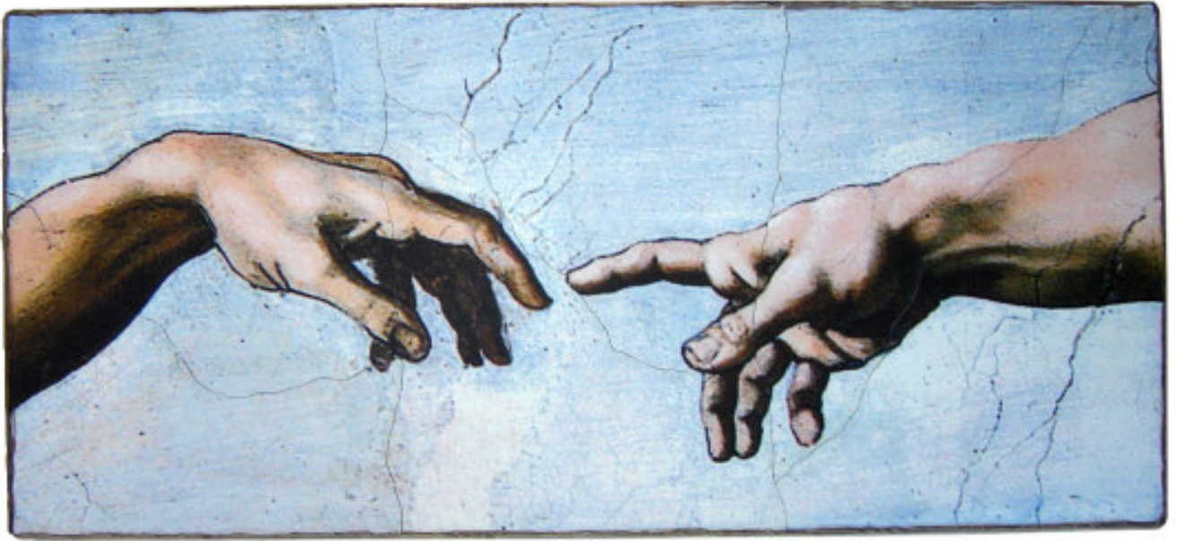
16 x 33 'Touching Fingers' (from Michelangelo's God creating Adam)

"And suddenly there was with the Angels a multitude of the heavenly host praising God and saying- Glory to God in the highest and on earth, peace and good will to all men"