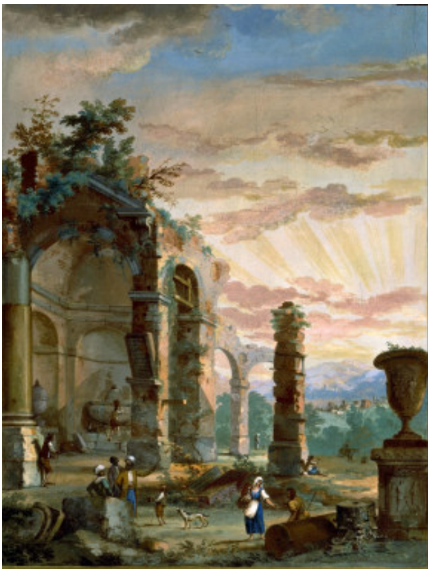
Villa Poggio 1