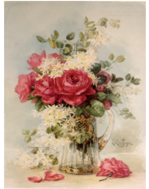
roses in jug