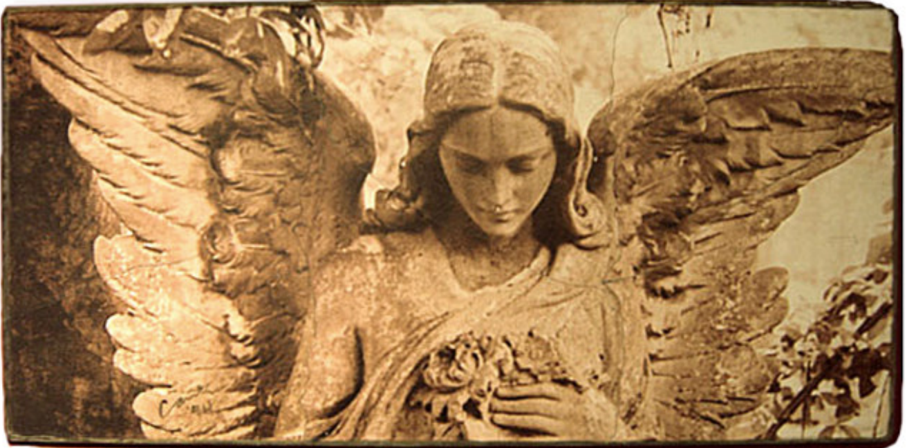
16 x 33 'Guardian Angel' (hand-cracked image) signed and dated artwork

16 x 33 Guardian Angel (hand cracked image)