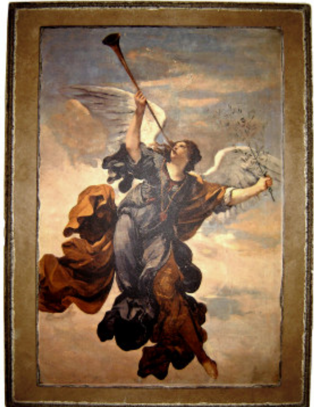
20 x 15 'Villa Angels' ( very very rare ) ARTWORK IS RAISED BY 1/4" signed