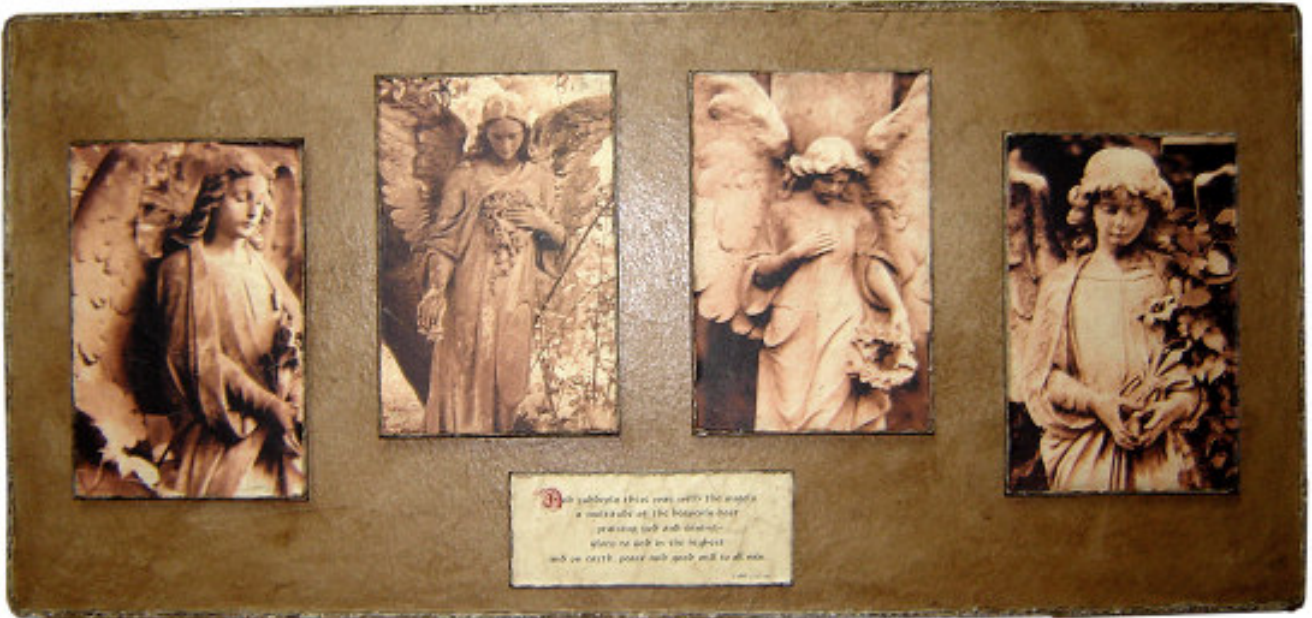
16 x 33 'Heavenly Host' (1/4" raised wood tablets each sized 6" x 9") signed and dated artwork

"And suddenly there was with the Angels a multitude of the heavenly host praising God and saying- Glory to God in the highest and on earth, peace and good will to all men"