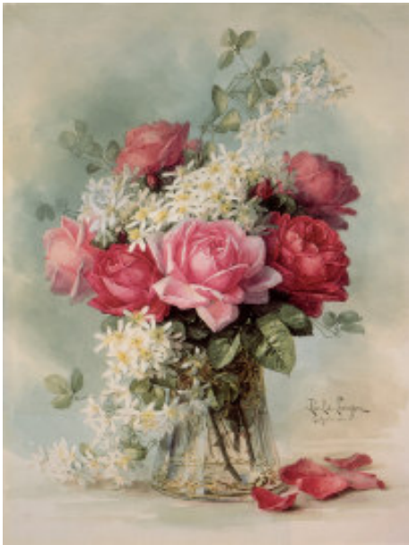
roses in vase