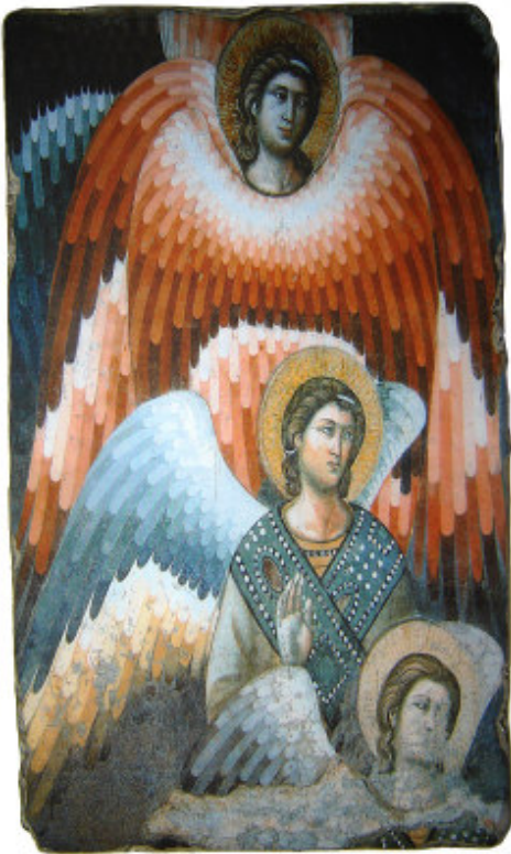
Judgement Angel 1