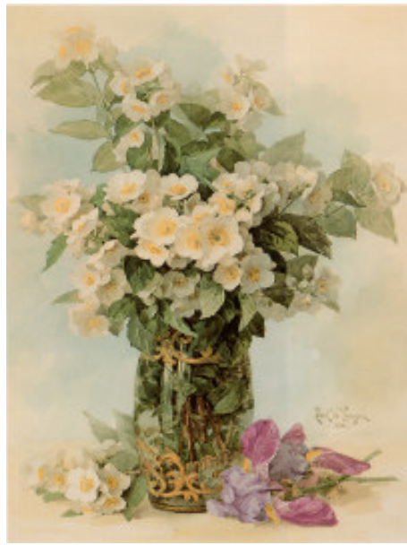
flowers in vase