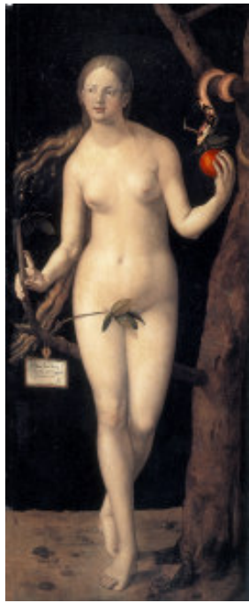
Durer - Adam & Eve - 16th century