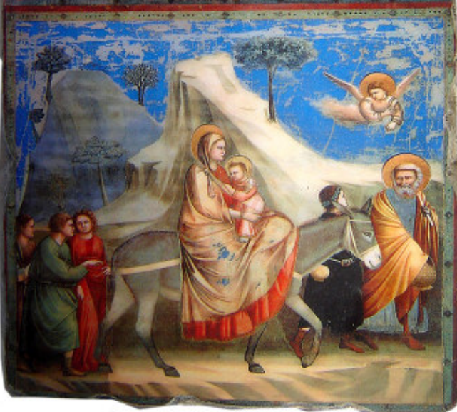
The Life of Jesus 1