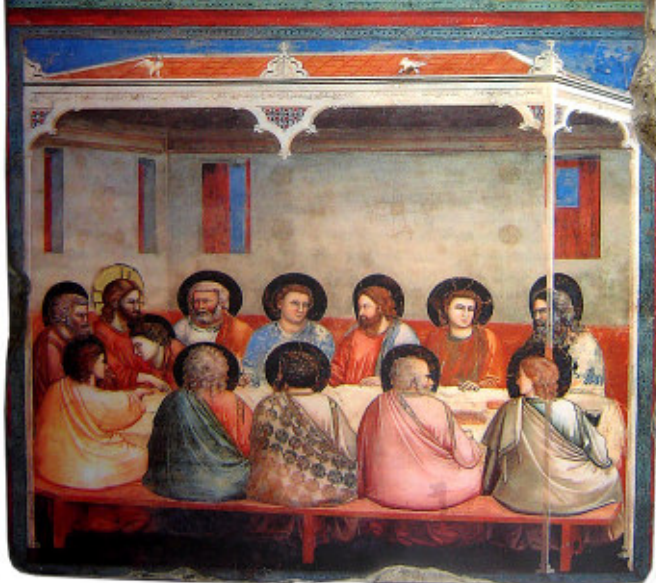
The Life of Jesus 2

on each of the 4 images Jesus's halo is gold leafed