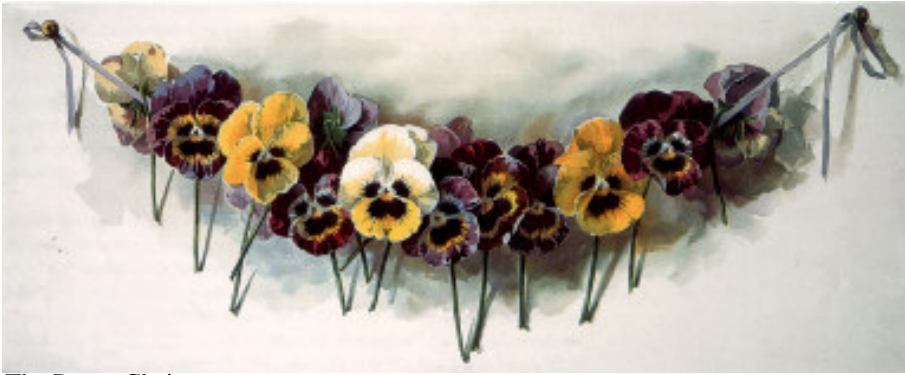
The Pansy Chain