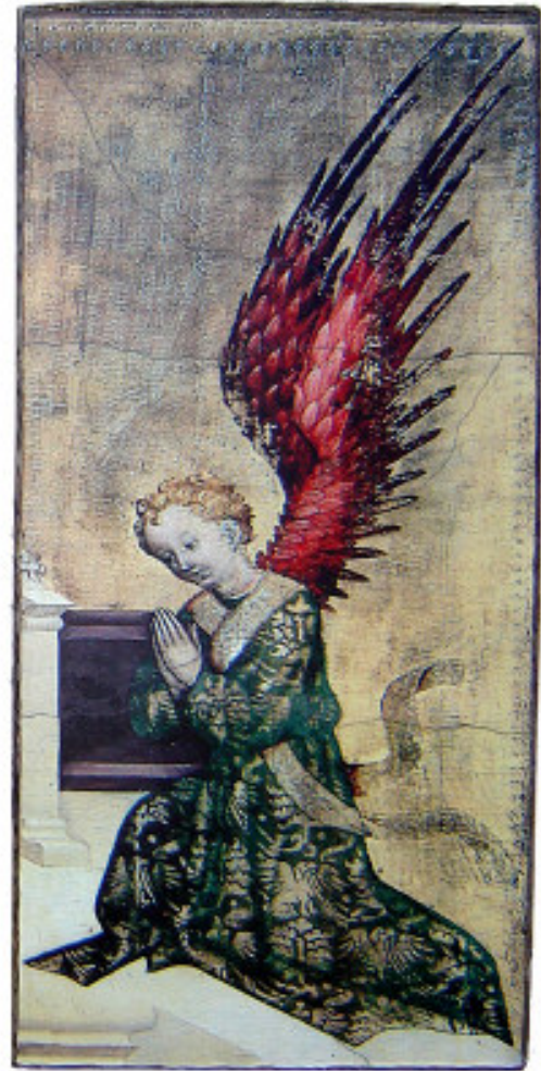
16 x 33 'Trinity Angels' (hand-cracked image)